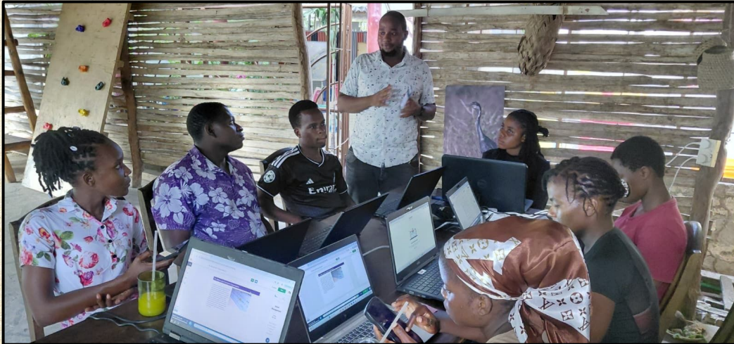
Computer classes for Work Ready graduates - Kenya

The Work Ready Training Program (previously called the Employability Training Program) reached a significant milestone, with 100% of the 4th Cohort , all 14 participants, successfully completing their 3-month internships and moving directly into real-world professional environments. This means the program is not only equipping young people with skills, but helping them take a clear next step into the workplace, where they can build experience, confidence, and stronger pathways to employment .