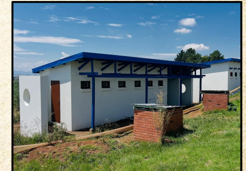
Before and After Leqele and Makoanyane P.S Toilets - Lesotho