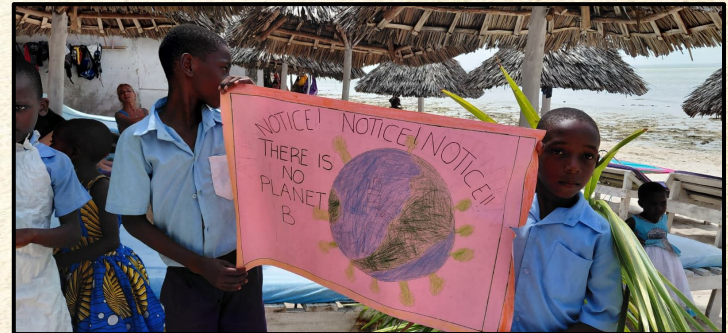
Junior Rangers Club attracted 144 children - Kenya