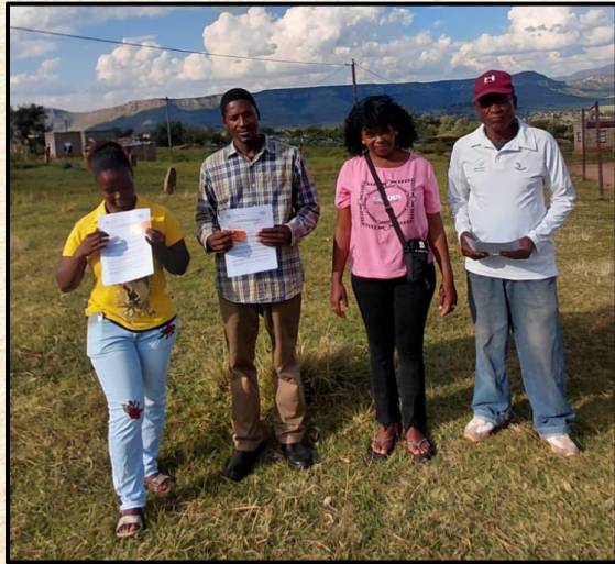
SSM representatives and the Chief of Makeneng - Lesotho

In March, a three-month heritage conservation project was launched at the Royal Village in Makeneng through Living the Heritage , led by Master's students in Architecture and Conservation from the University of Malta . Working with the Seriti sa Makhoarane Heritage and Tourism Network (SSM) and the Makeneng Chief, the project focuses on stabilising this important cultural site while supporting wider efforts to protect and revitalise the local heritage landscape .