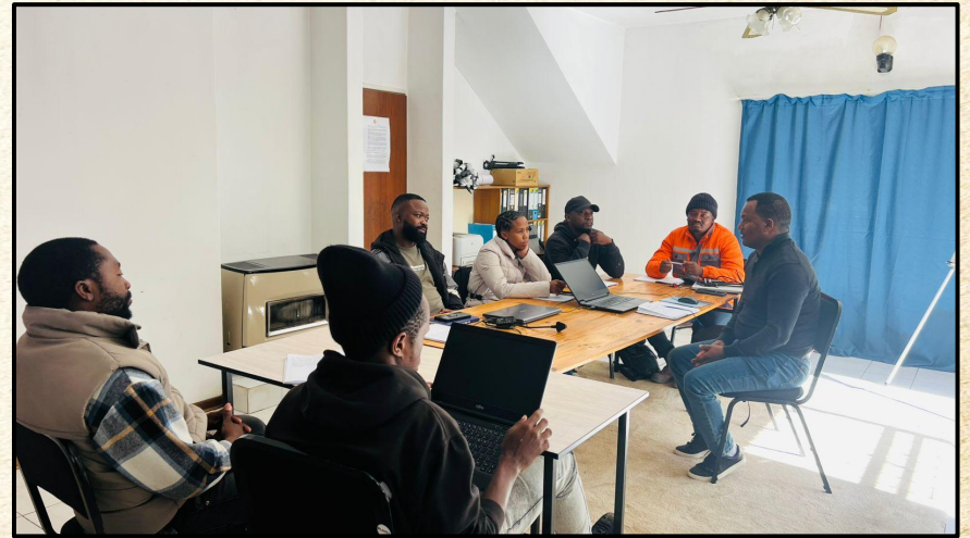
CAFI Incubation Program sessions - Lesotho