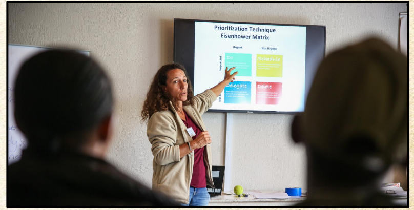
Work Ready program facilitators' training at The Hub - Lesotho