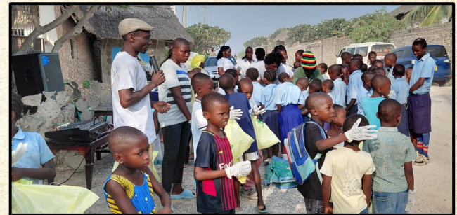
Community Clean-up Event - Kenya