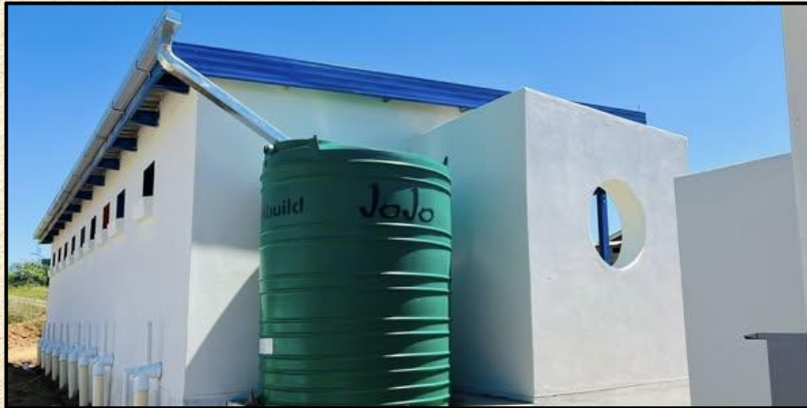
New toilets at Makoanyane Primary School - Lesotho

With more than 50% of schools in Lesotho still lacking access to basic WASH services, this work speaks directly to a national challenge. Makoanyane shows what progress can look like in practice, while Cenez points to where that commitment can go next, helping reduce the number of school communities still learning without safe and dignified sanitation.