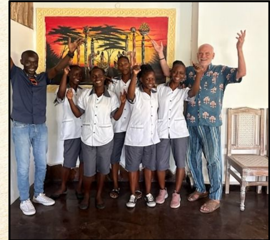
Work Ready graduates in their work placements - Kenya