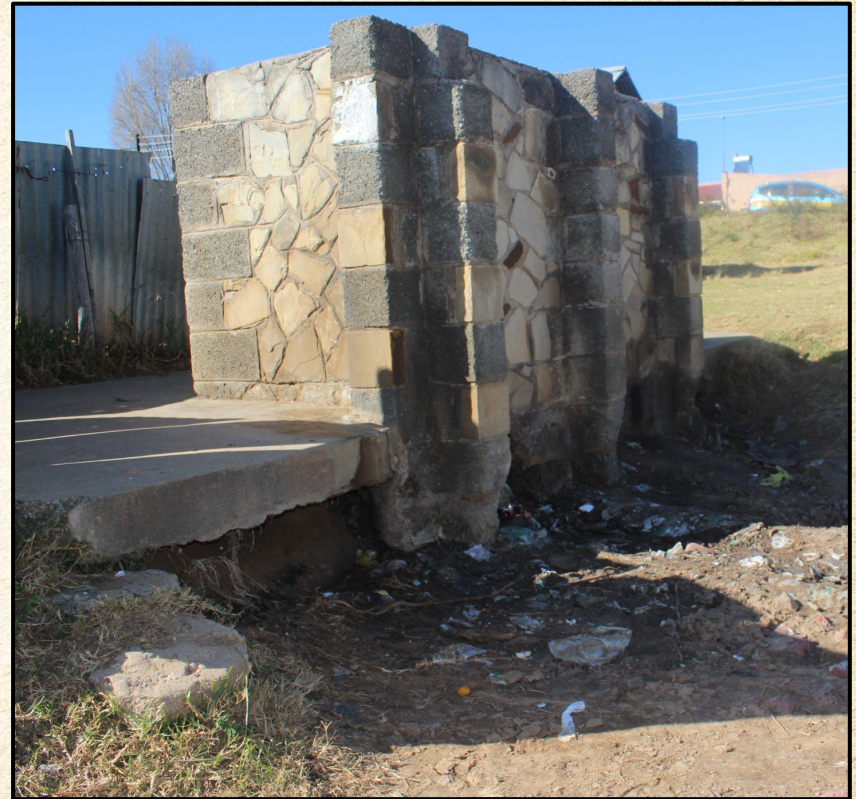
Current pit latrines at Cenez Primary School - Lesotho