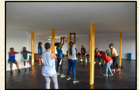
Stadium of Life & Bophelo Health and Gymnasium - Kick4Life | Lesotho